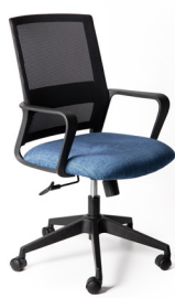
Hart - Upholstered in your fabric of choice