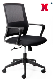
Hart - Black Fabric